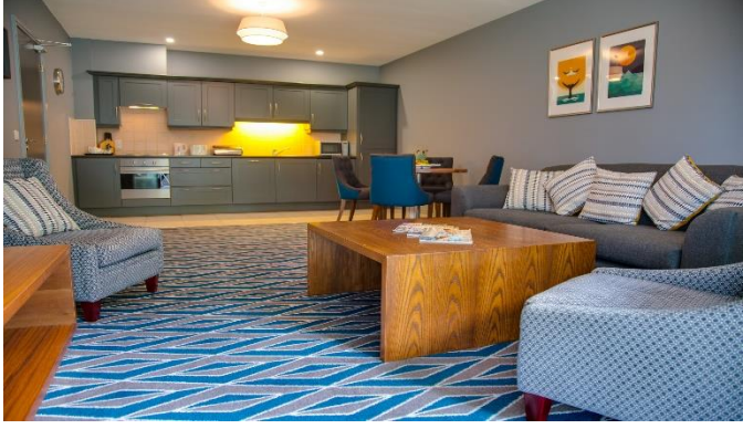
Two Bedroom Apartment